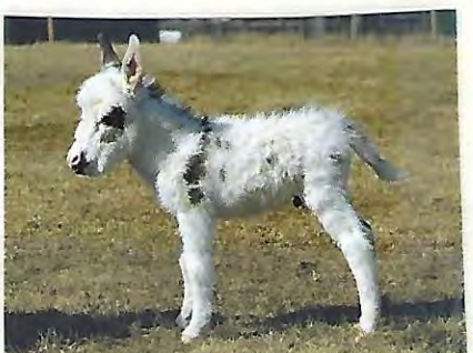
HHA Moon Knight 02.jpg

The American Donkey and Mule Society P.O. Box 1210, Lewisville, TX 75067 (972) 219-0781 The American Donkey and Mule Society is not responsible for errors in information submitted to the registry.