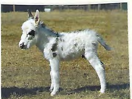
HHA Moon Knight 02.jpg

The American Donkey and Mule Society P.O. Box 1210, Lewisville, TX 75067 (972) 219-0781 The American Donkey and Mule Society is not responsible for errors in information submitted to the registry.